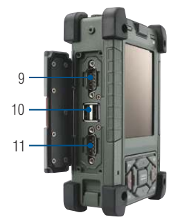
9. RS 232 10. USB type A (USB 1.1 Host) 11. RS 232 (RS422/RS485)