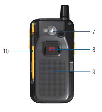
7. 5 Mega CCD 8. Battery Catch 9. SIM/SAM/MicroSD Slot (inside) 10.Stylus