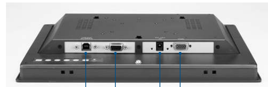
Touch Screen (USB) Touch Screen (RS-232) 100 ~ 240 V AC Power Adapter VGA Port