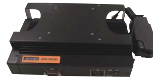
ARK-DS303 with standard mounting bracket