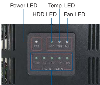
Power voltage status