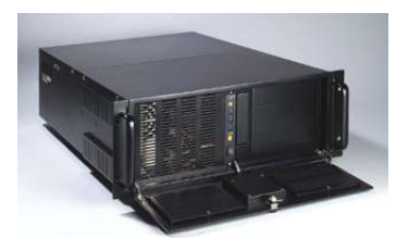
Front panel appearance while with single power supply configuration