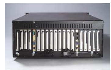
Dual AC power cords for 460 W / 570 W / 810 W redundant power supply