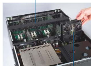
Three 114 CFM hot-swappable fans