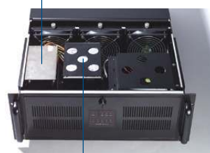
Extra drive bay which can hold up to three 3.5" HDDs